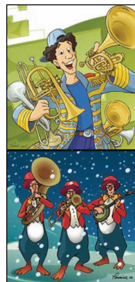
TOP: Fred Piston and His Seven Trumpets.

Two special holiday performances of “Le grand bal de Noël” offered in French took place on December 6th in which penguin musicians [in costume!] who have waddled all the way to the North Pole for the great Christmas party but are refused admission.