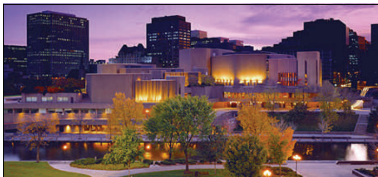
Canada's National Arts Centre

Phone: 613-947-7000 x390 Fax: 613-992-5225 E-mail: mused@nac-cna.ca