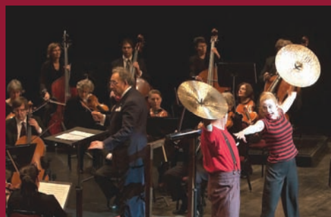
"The Listener" with Canada's NAC Orchestra (see page 2)