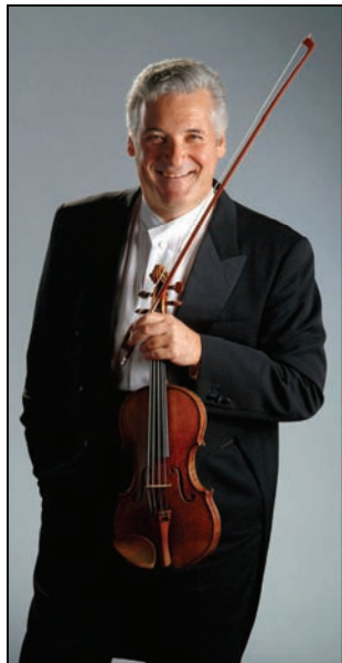
Maestro Pinchas Zukerman

Our Music Director, Pinchas Zukerman, has had a busy fall full of concerts, international tours and education activities.