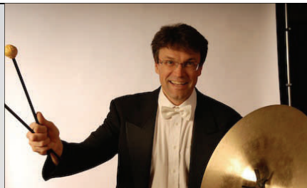
Kenneth Simpson