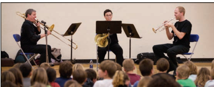
The NAC Ambassador Trio

Three Musicians in the Schools performances took place this fall: the Rideau Lakes Brass Quintet performed a concert for 41 students at l'École élémentaire catholique La Vérendrye on November 20th; the Ambassador Trio visited a class of 34 students at March Academy on November 23rd; and the String Quintet performed at the Orleans Montessori Children's House on December 4th in which 40 students were in attendance.